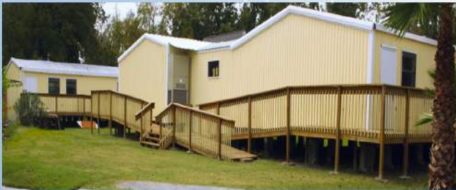
Heaven's Kitchen and Cafeteria