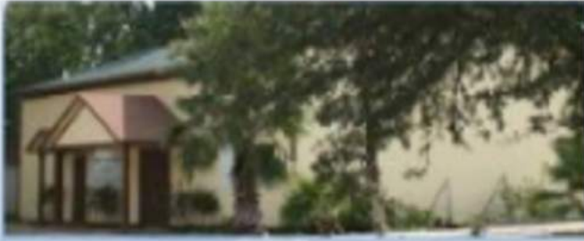
Multi Purpose Annex Facility